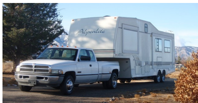
The new truck and trailer, December 18, 2009

Amazing result: Within 8 days of meeting them and seeing the trailer, just over half the funds needed for it had come in. We were corresponding via email almost daily with the trailer owners. Within 11 days the young couple emailed us letting us know that they received an offer for the full amount they wanted for their trailer from someone else. We quickly responded with sincere congratulations and thanked them for letting us know, telling them that we were greatly excited for them. Amazingly , they